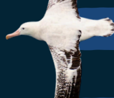
Albatross Carcharhinus brachyurus