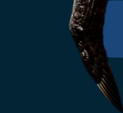
Petrel Carcharhinus limbatus