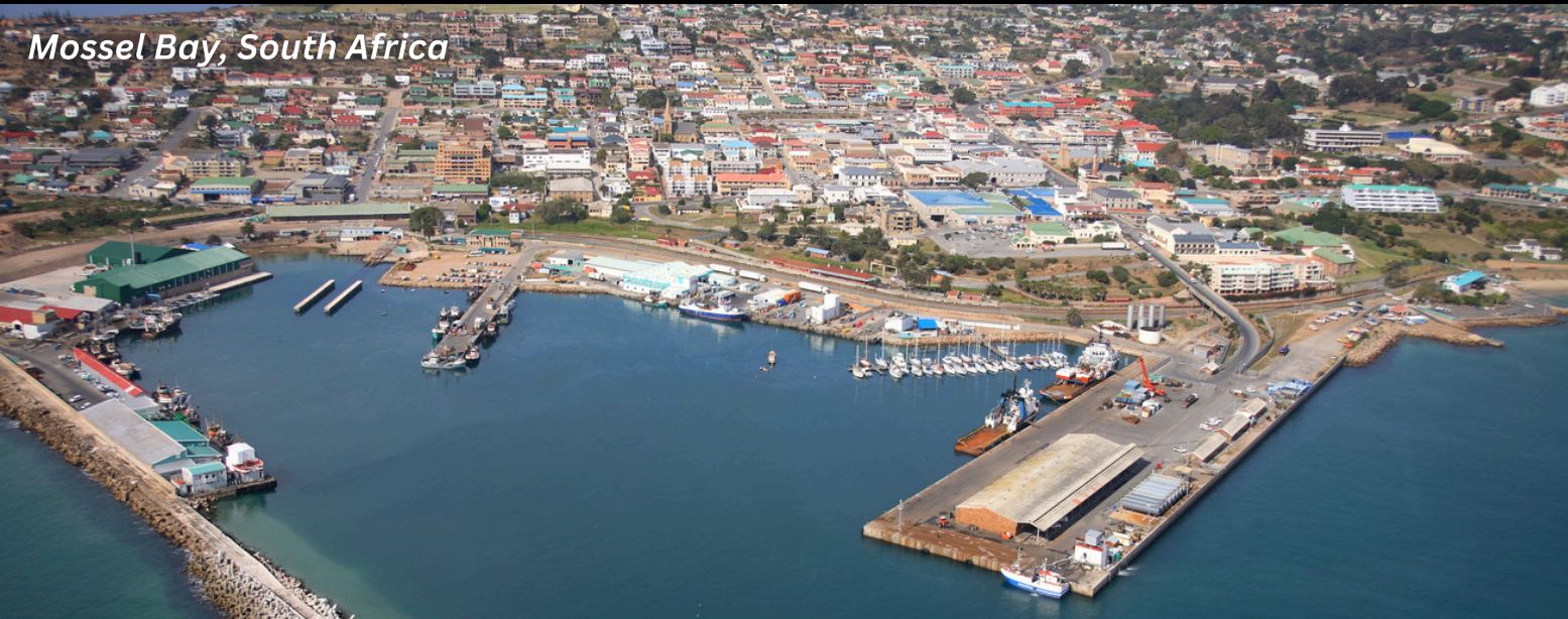
Mossel Bay, South Africa

Accommodation is included in the program fee. Throughout your program you will stay in self-catering dormitory style accommodation in central Mossel Bay. Searle's Manor is located within easy walking distance to the dive center, shops, restaurants, and the harbor. There are 2-3 rooms in each unit that are divided according to gender and have two - three beds per room. There is free Wi-Fi available, which makes staying connected with loved ones easy. There is also a communal kitchen and full bathroom in each unit. All bedding is provided.