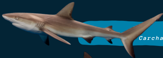
Dusky Carcharhinus obscurus