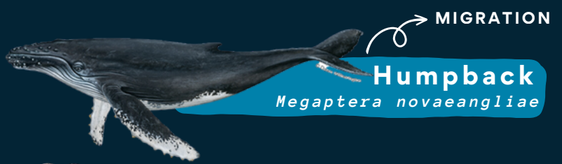
Humpback Megaptera novaeangliae