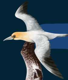
Cape Gannet Carcharhinus obscurus