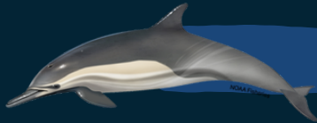
Common Delphinus delphis