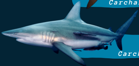
Blacktip Carcharhinus limbatus