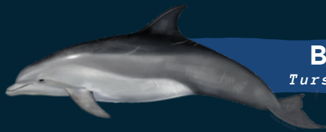
Bottlenose Tursiops truncatus