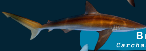
Bronze Whaler Carcharhinus brachyurus